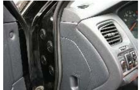
Hidden into the driver-side dash