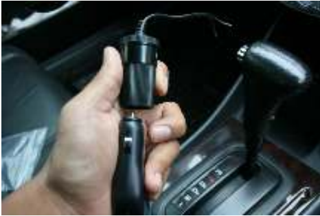
Connect the splice adapter