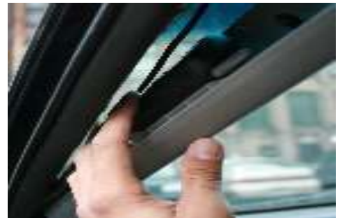
Tucked in the driver-side pillar