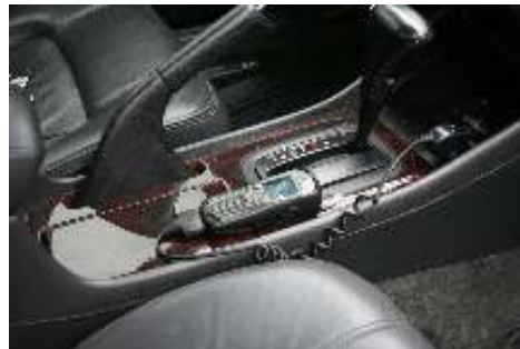
D. This is an example of a non-discrete location