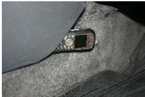
Tucked into the center console