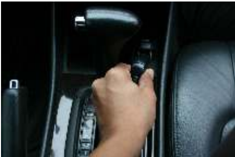
A. Plug the car charger into the AC power port

You can also use the portable non-discrete method with external power, so that others may track you or for you to track someone such as employees, family members, or children. (An example of a non-discrete area, is provided below)