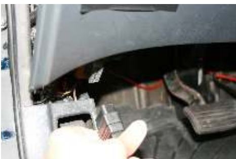
Plug OBDII connector into the OBDII port to power transmitter.