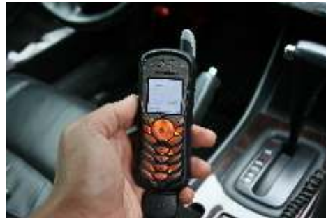
C. Press the {Power} key SoftDash Anywhere starts automatically