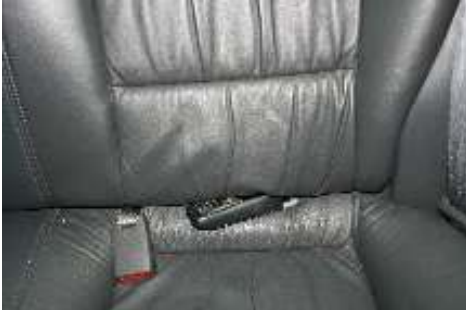
Tucked in the rear seat

You can place the Anywhere transmitter device almost anywhere that is discrete and secure from potential threat. For the mobile GPS transmitter, you would want to place it in an area that it is accessible but not visible. Do not burn in an area such as the trunk where metal will obstruct the sky view for GPS lock. (Examples of discrete areas are, provided below)