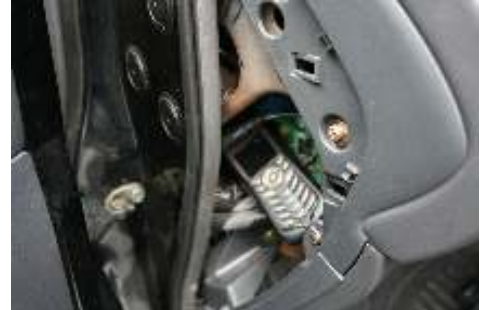
Tucked into the driver-side dash