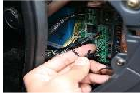
Finding negative and positive power sources in the fuse box