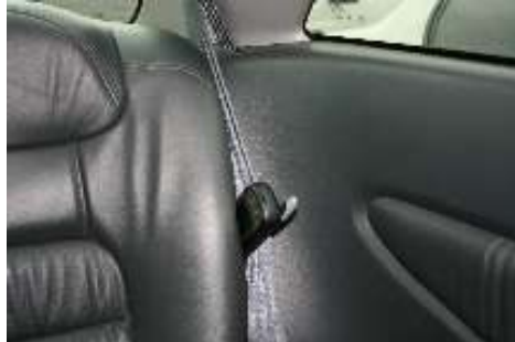
Tucked in the side of rear seat