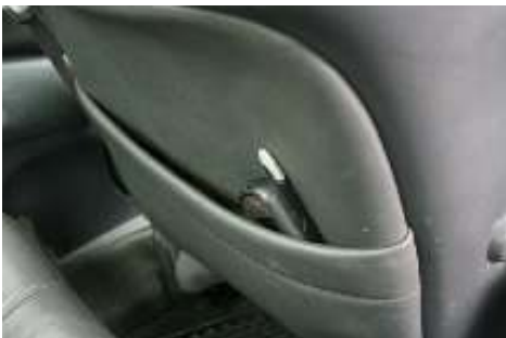
Tucked into the seat pocket