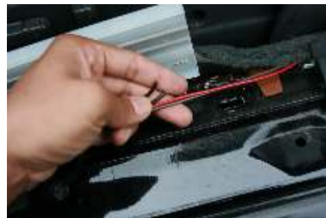
Finding negative a positive power sources in the floor wires