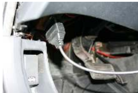
OBDII cable connected