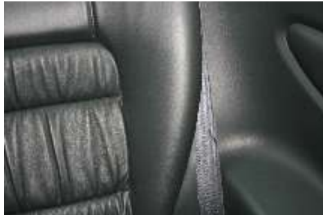
Hidden in the side of rear seat