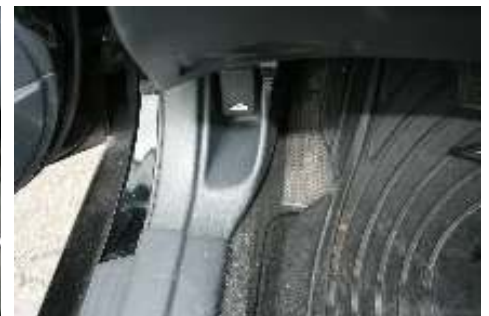
Done! No wires showing.