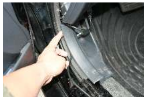
Neatly dress the wires under the plastic panels for a clean and discrete install