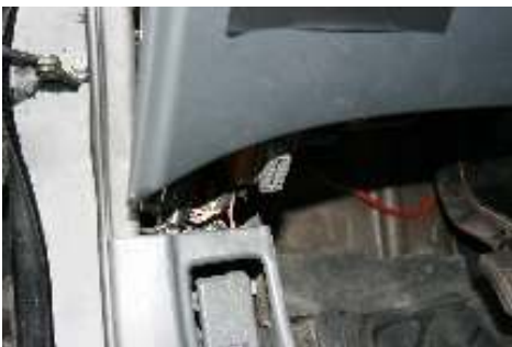
Locate OBDII port under dash