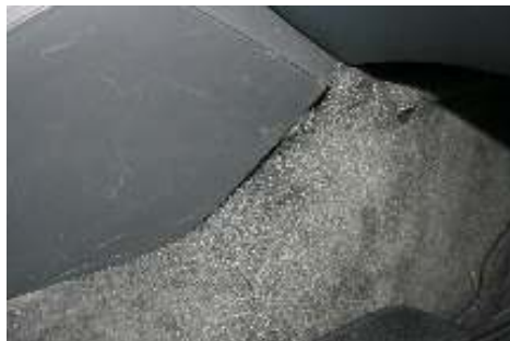
Hidden into the center console