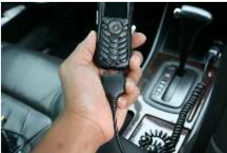
B. Plug the other end into the transmitter