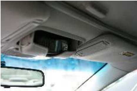
Placed in the glasses enclosure