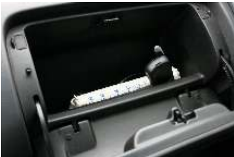
Placed in the glove box